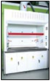
F U M E C U P B O A R D S