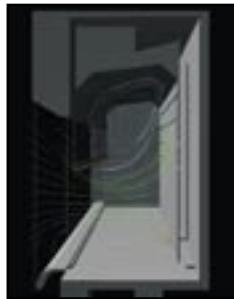
Fig 1: Airflow within the Enterprise DynamicFlow Fume Cupboard with Sash Open.