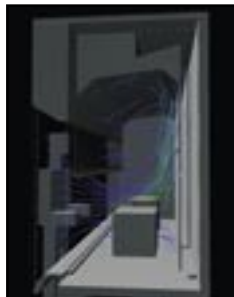
Fig 2: Airflow within the Enterprise DynamicFlow Fume Cupboard with Sash Open and an operator in position